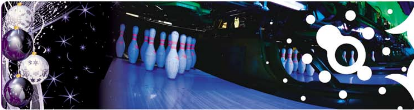
Pin setters at Kingpin