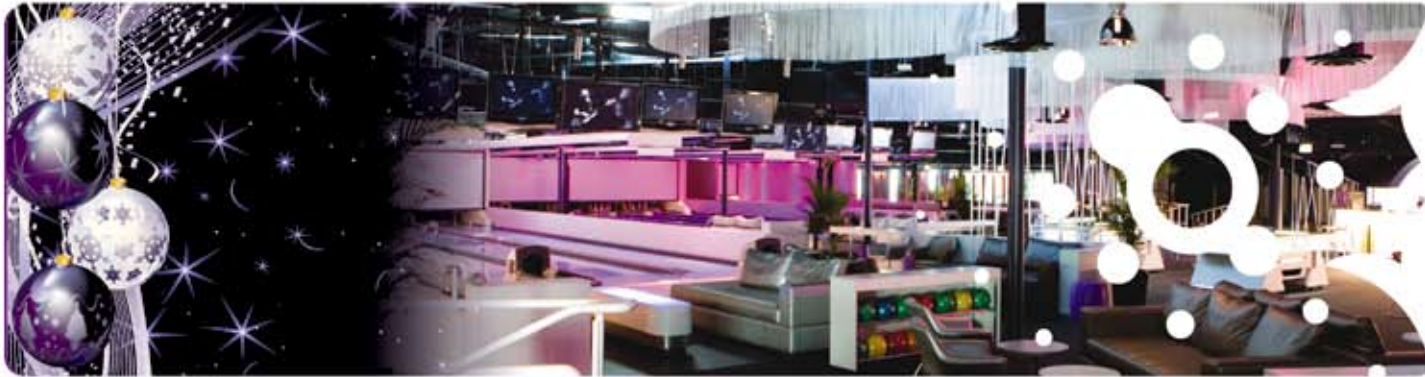
Photo lanes at Kingpin