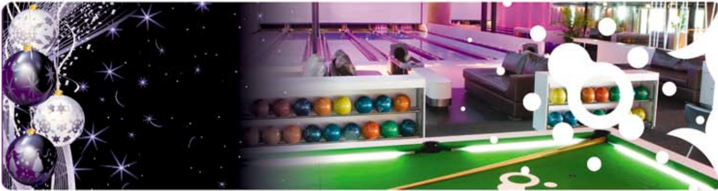
Pool tables & lanes at Kingpin Darling Harbour