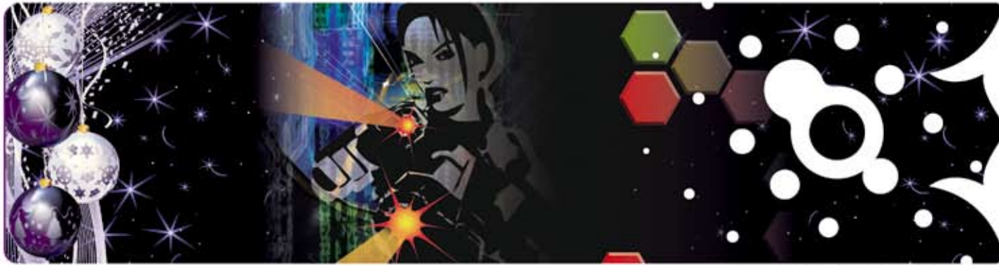
Let the battle begin... M9 Laser Skirmish