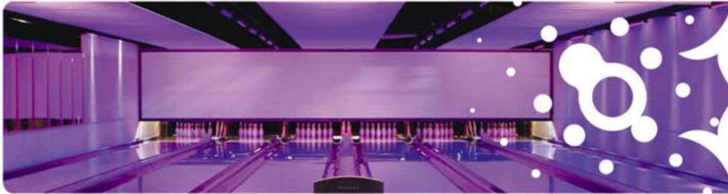
Lanes at Kingpin Darling Harbour